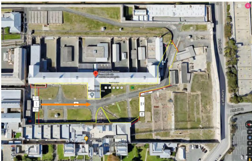
Fremantle Prison Venue Layout